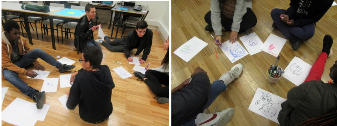
Figure 2. Integration activities in group, creating drawings and stories

As we observed in the generational stages, the new environment demands multicultural citizens, wanting to learn and innovate; but this motive is necessary to encourage strategies of adaptability, to create solutions to problems, create alternatives and be adapted in this way to the changes that are constantly generated in our global environment.