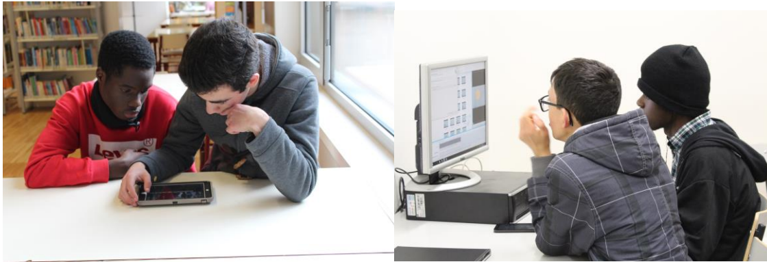
Figure 1. Work with digital animations, news, video and photo editing with computers, tablets and cellphones

social integration and identity strengthening; and creation of games with QR codes, to create group interaction and teamwork.