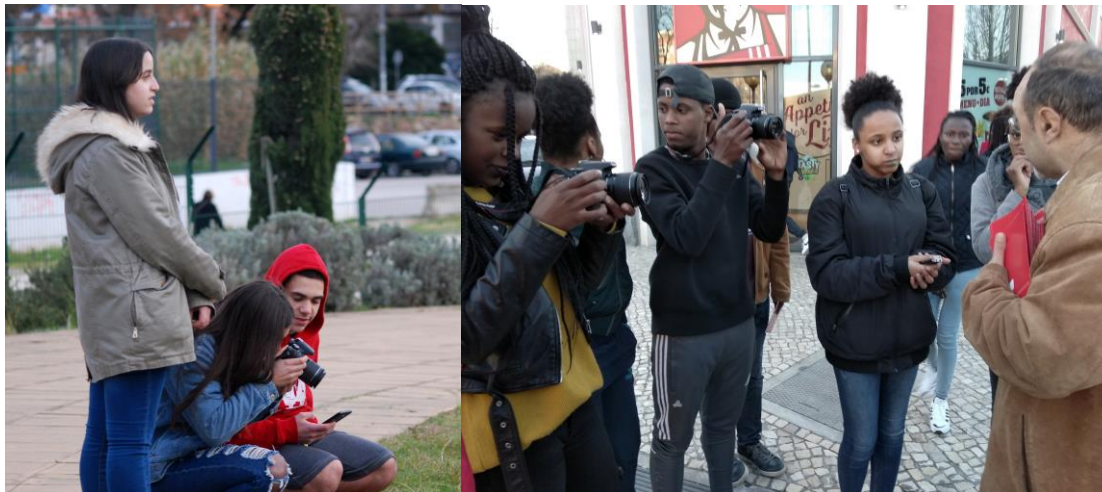
Figure 4. Activities with the community, Derive, interviews, photographic and video documentation

For this reason, these dynamics, such as creating videos, interviews, games and thinking from the community, can function as tools that, in addition to show the look of the youth of their communities, keep alive the collective cultural identity derived from community knowledge.